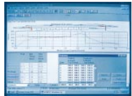
Figure 1. Thermal profiling software records events taking place during the thermal process and displays them for immediate viewing or stores them for later recall and analysis.